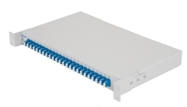
ZMPJ-1, 1U base unit with FM-24 DLC front panel

The ZMPJ Fixed Cabinet introduces a compact, low cost solution for fiber optic cable termination. The ZMPJ series is ideal for rack-mounting in confined areas such as equipment enclosures where rack space is limited. The modular system allows splicing and termination up to 48 fibers in rack height 1U.